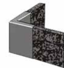
Corner Guard - 12"