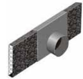
Tee Outlet - Combination Drain