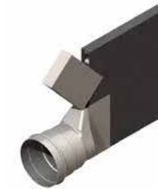
End Outlet - Combination Drain